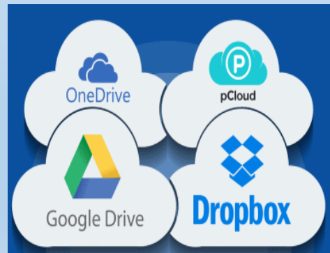
SHUT DOWN APPS