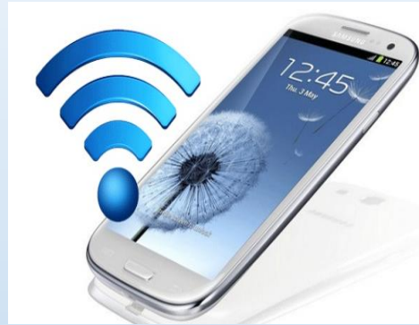
DISCONNECT MOBILE DEVICES FROM YOUR WIFI