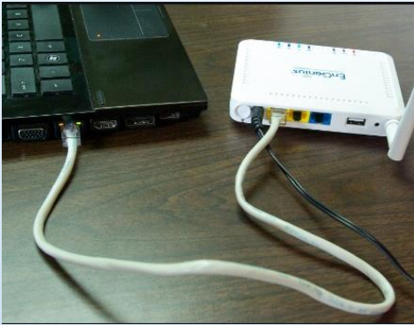
USE CABLE CONECTIONS