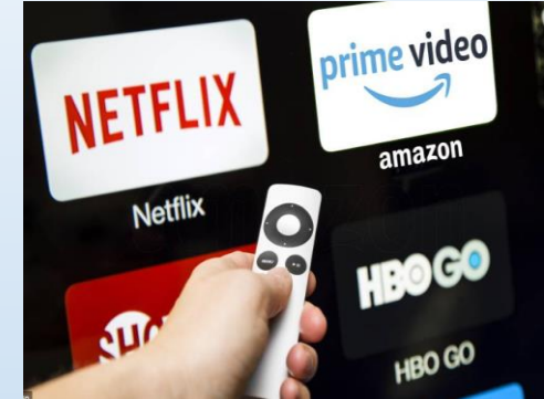
DO NOT USE STREAMING VIDEO